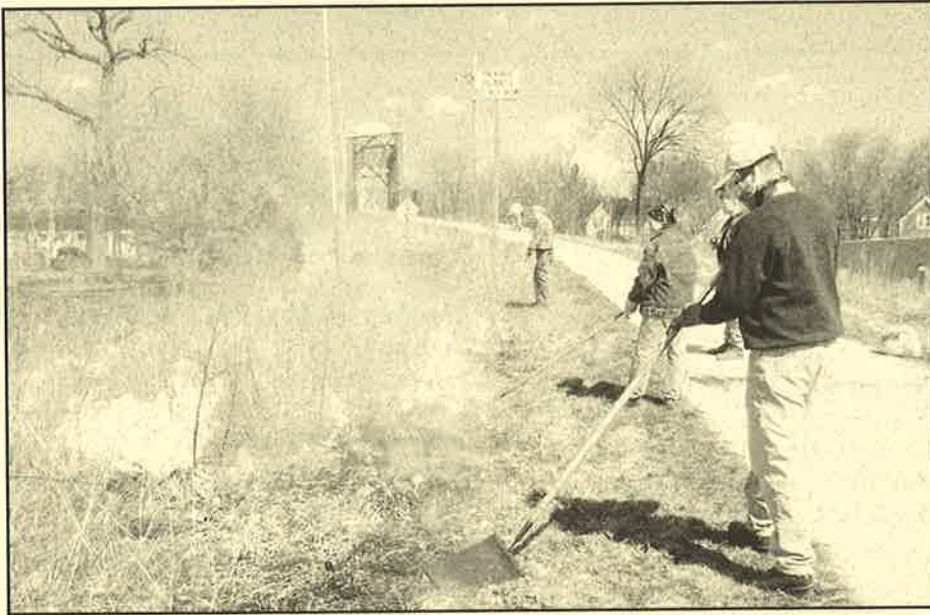
IPP volunteers including Rob Sperl (foreground) assist with several prairie burns in Wheaton and West Chicago. Burns were conducted with supervision of prairie expert Larry Sheaffer.