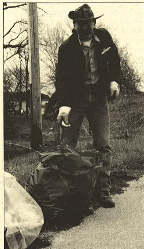
Wheaton More than 250 volunteers work to clean up the trail at the Earth Day cleanup on April 27.